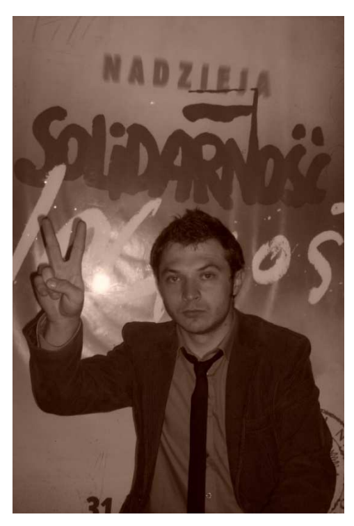
Oh, no, no, they didn't invite me to the casting.

Each mail was always accompanied by some picture completely out of place, a picture sent from the bottom of my heart, showing the real me.